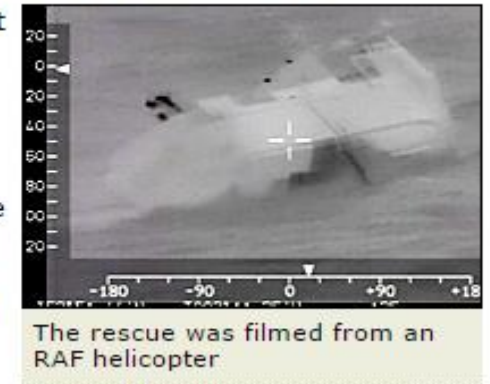
The rescue was filmed from an RAF helicopter

Fourteen passengers had to be airlifted from the Riverdance freight ferry, nine remaining crew members were rescued after a second Mayday was declared.