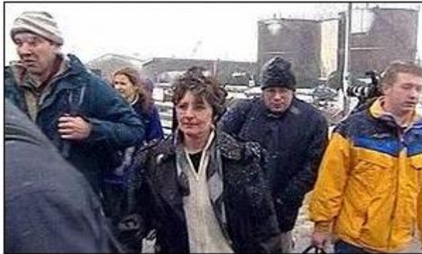
Passengers disembark from the ferry

More than 100 relieved ferry passengers have made it back to dry land after a 40-hour ordeal in the North Sea.